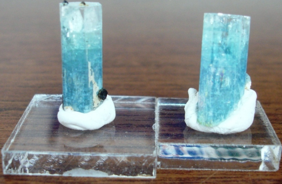
Group 2 Aquamarine Crystals about .75" to 1" tall and .25" to .375" wide for $65 each